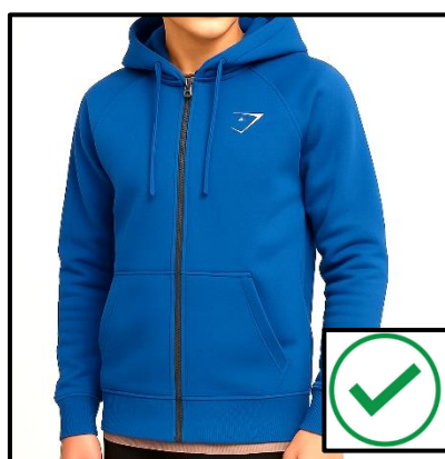
Hooded jacket: permitted when worn as a coat.