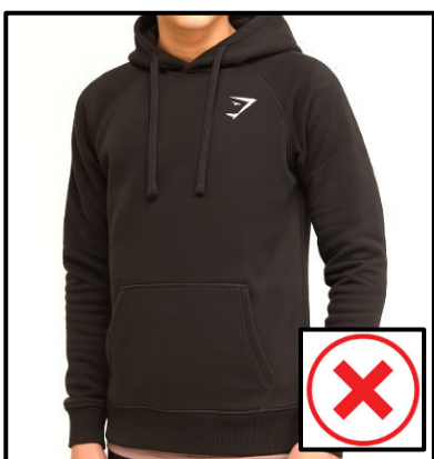
Hoodie jumper: Not permitted)

Hooded jackets with a full zipper (see blue illustration below) are classed as coats and must be worn in accordance with the rules above regarding coats and jackets.