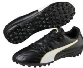
Artificial turf training shoes