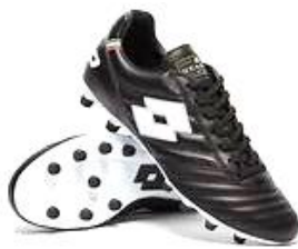
Hard ground plastic moulded stud