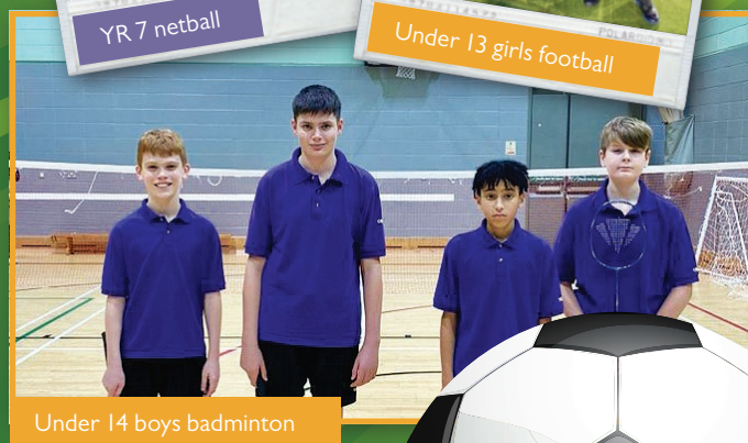
Under 14 boys badminton