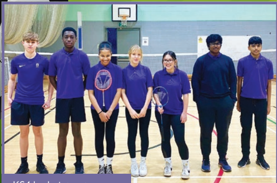
KS4 badminton team