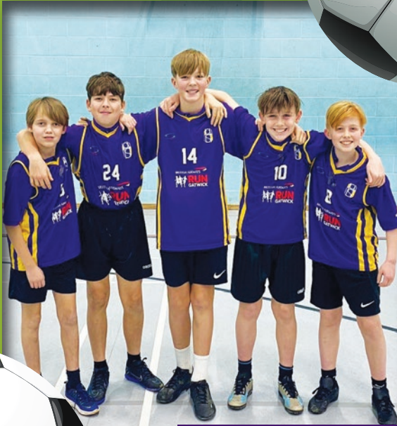
Year 7 boys basket ball team