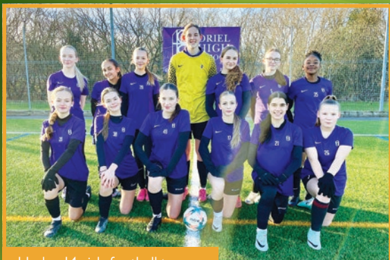
Under 14 girls football team