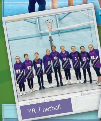
YR 7 netball