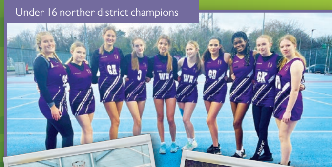
Under 16 northern district champions