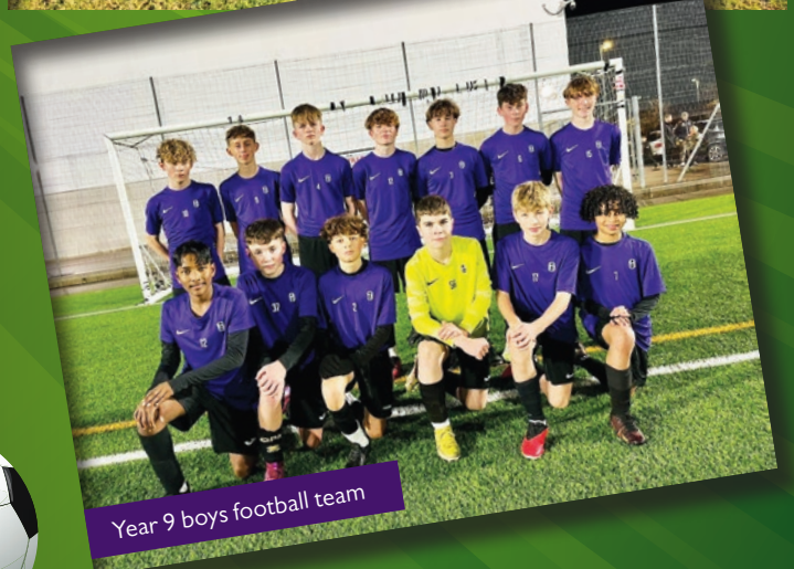
Year 9 boys football team