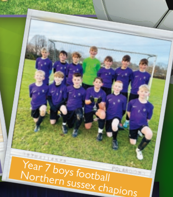
Year 7 boys football Northern Sussex champions