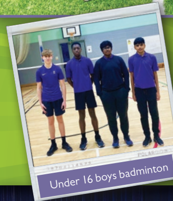
Under 16 boys badminton