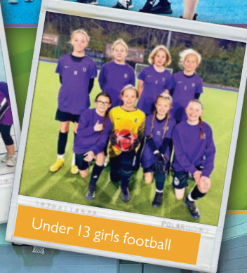
Under 13 girls football