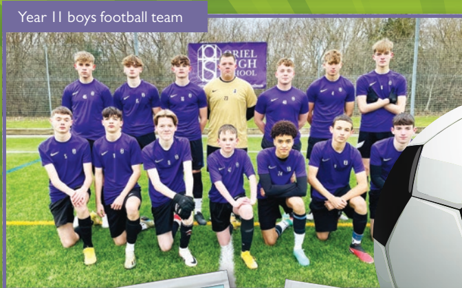
Year 11 boys football team