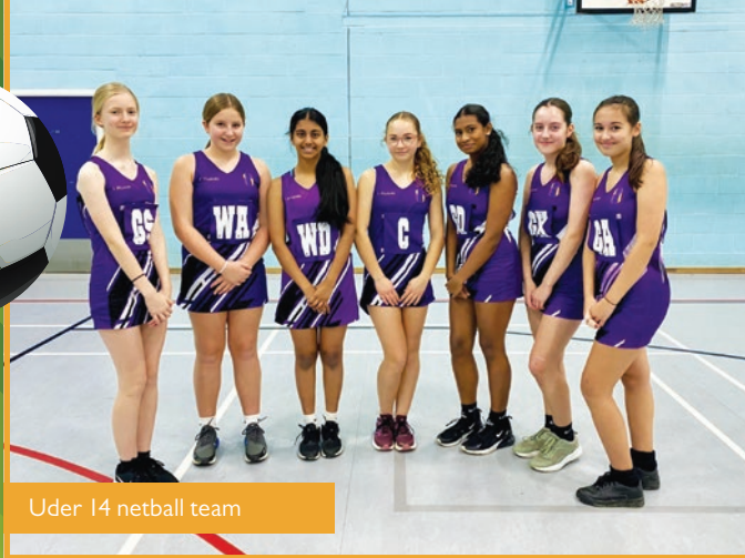
Under 14 netball team

Congratulations to the UI4 and UI6 boys' badminton teams, who both won their tournaments at St Wilfrid's, with the UI6 team winning all ten of their games.