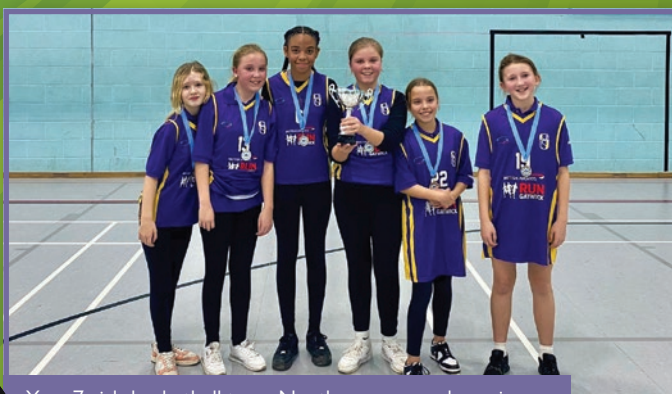
Year 7 girls basketball team Northern Sussex champions