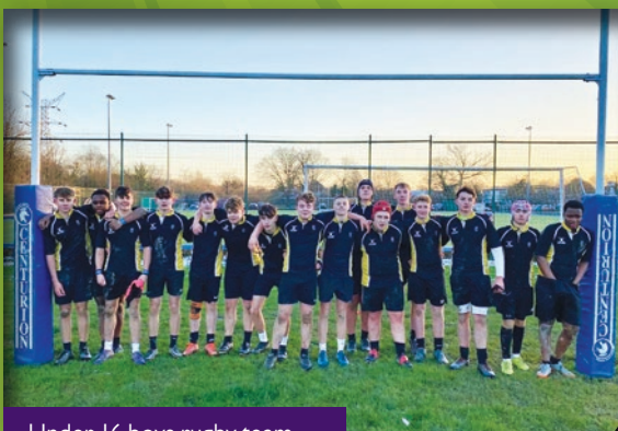
Under 16 boys rugby team