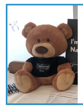
Blaze the Bear started his journey across the UK in the North West, attending events alongside young apprentice ambassadors. His travels included a visit to Weightmans Law Firm and he celebrated National Pie Week in Manchester!