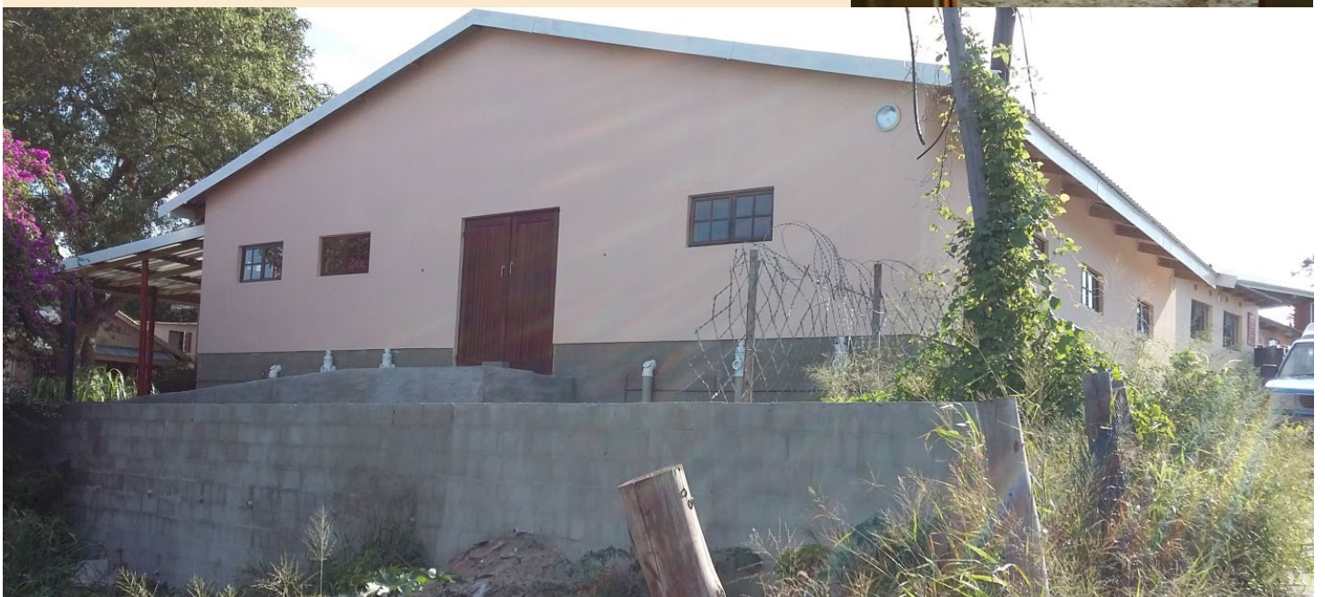
A view of the back of the crèche where a plaque thanking Oriel will be positioned.